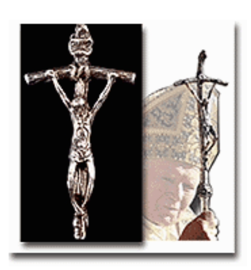
The Satanic Bent Cross

To see other obvious Satanic symbols being openly used by the Roman Catholic Church, click here.