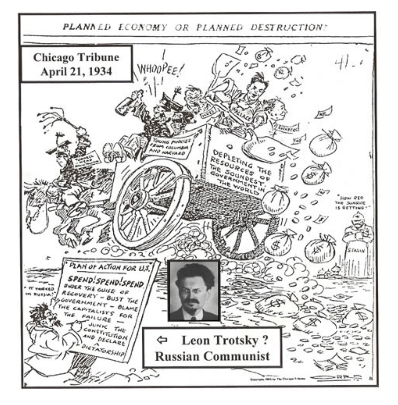
Please notice the cartoon character in the lower left.