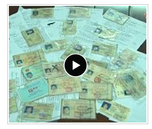
COUNTERFEIT DRIVER'S LICENSES AND OTHER DOCUMENTS SEIZED ACROSS VIETNAM