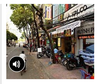
Ho Chi Minh City to establish 'jewelry streets'

On Tuesday, April 1, the exercise is scheduled to continue off Natuna, and seamen from several countries will hold a practice tsunami evacuation.