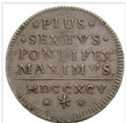
Papal coin of Pius VI from the 1700s, with the title "Pius VI Pontifex Maximus."...

A coin of the Vatican state says this about Pope Pius VI: